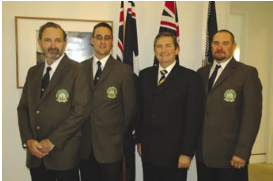
Minister for Justice and Customs Senator the Hon. Chris Ellison wishes the SSAA Australian Pistol Team good luck for Bianchi 2006.

tion that eventually saw him being taken to a local hospital for a check-up. "It was the worst I have felt in all the years I have been shooting, and, as luck would have it, the illness came along right in the middle of the world's most prestigious handgun event. My STI in .38 Super performed well this year and I was satisfied that my reloads are meet-