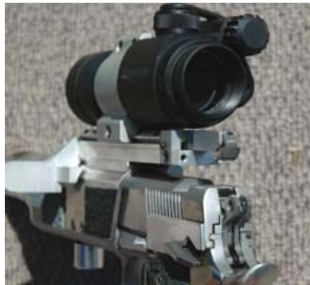
The direction lever (centre under the rear optical lens) is moved to compensate for the lead required on the moving target.