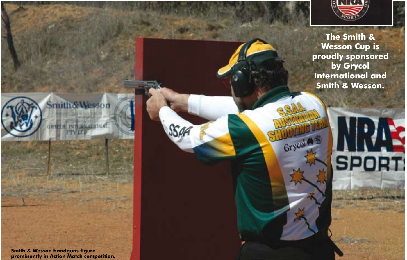
Smith & Wesson handguns figure prominently in Action Match competition.

The Smith & Wesson Cup is proudly sponsored by Grycol International and Smith & Wesson.