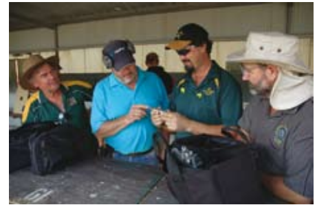
Pete's Gun Works mover mount creates a lot of interest at matches.

The pins and locking mechanism are machined and then all the pieces are hand-fitted together to a tight fit. The aluminium parts can be anodised different colors at the